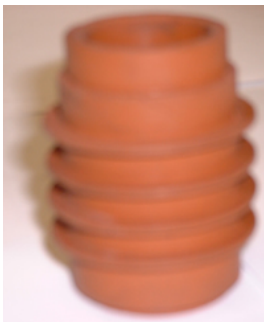
TYPE CG QUAD SEAL PACKER